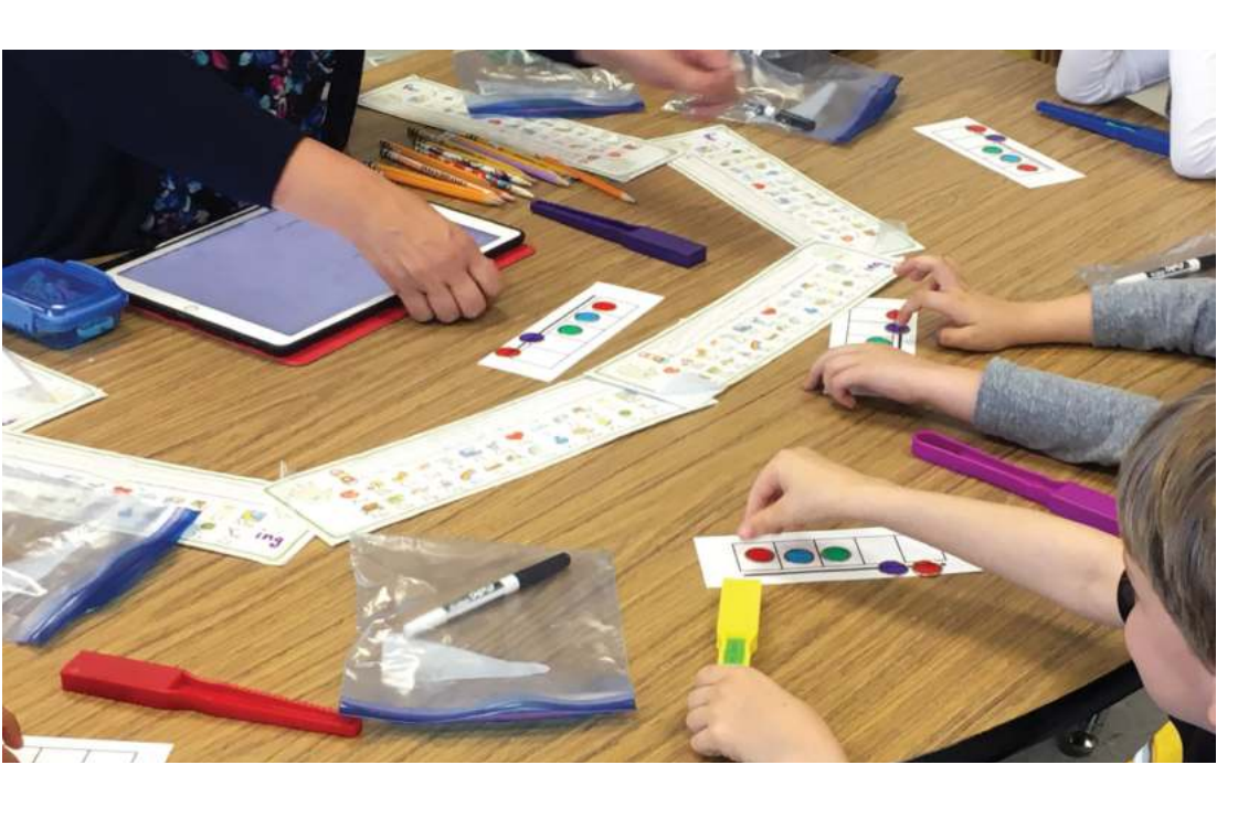
Students participate in activities that help them become strong readers with solid foundational skills.