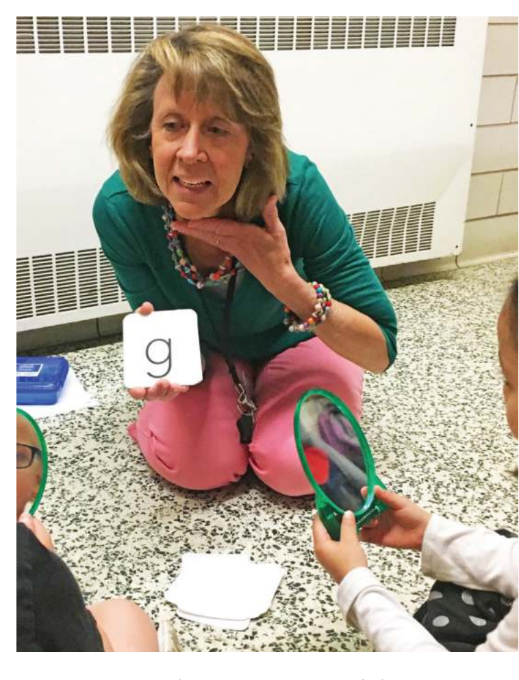
LPS students now work with teachers on sounds and facial expressions as they learn reading and spelling.

"Not a day goes by without a fellow educator asking me when he or she will have the opportunity to participate in LETRS," Wagner said. "At a time when the demands on teachers are many, the fact that our colleagues are eagerly signing up for LETRS training is telling in and of itself: Once educators get a taste of LETRS, it leaves them craving more."